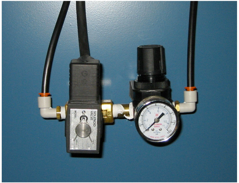
Connect Air line to right side of Regulator. Air should be clean and dry.