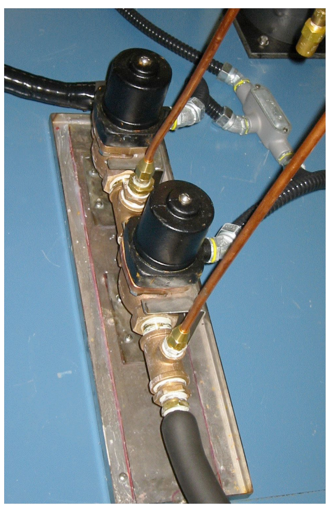
LN2 should be connected to Input of Regulator @ 75 PSI Max.

\label{lem:controlled} \mbox{Authorization and Copyright of this document is controlled by Hanse Environmental, Inc.}